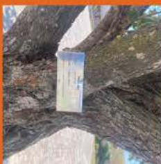
62 Indigenous Trees